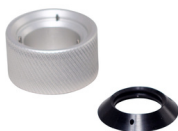
Security nut fastening and tool Model number: 53211 and 55029