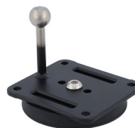
Magnetic mounting bracket Model number: 53330