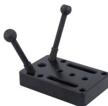
Dual mount Model number: 53342