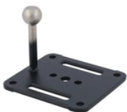
Mounting plate Model number: 53317