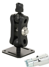
Adjustable mounting bracket Model number: 53333