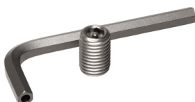
Security locking bolt and tool Model number: 53324 and 55039