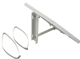
Solar panel mounting tool Model number: 53705